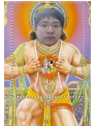
Hanuman finds Sita.